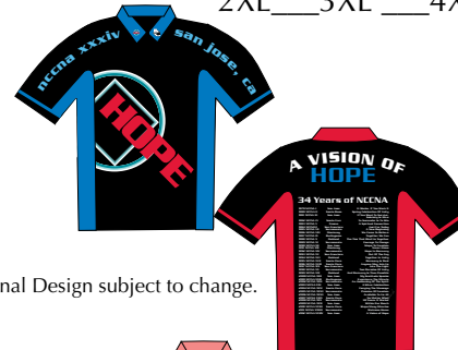
(Final Design subject to change.)

Women's ___S ___M ___L ___XL ___XXL 2XL ___3XL ___4XL